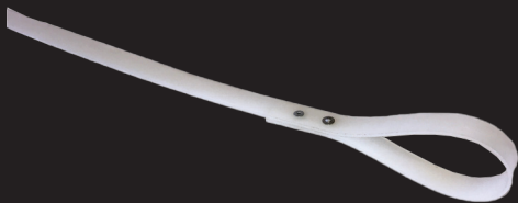
Feeder Tool Quickly feeds strap under load.