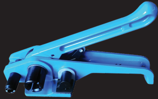
H-25 Tensioning Tool for 5/8" - 1" Polyester Strapping

Industrial-strength strapping solutions for everyday professionals. Not sure where to start? We can help.