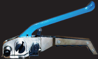
H-26 Heavy-Duty Tensioning Tool for 3/4" - 1-1/2" Polyester Strapping